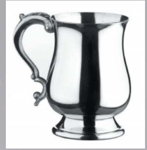
6004 Georgian 1 pint pewter tankard 12.5cm h x 8cm base diameter