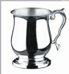
5002 Old English silver plated 1 pint tankard 11.5cm h x 8.5cm base diameter