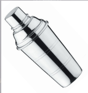
5001 Cocktail shaker 21cm h x 8.5cm diameter