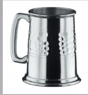
6003 Half-hammered 1 pint pewter tankard 12cm h x 10cm base diameter