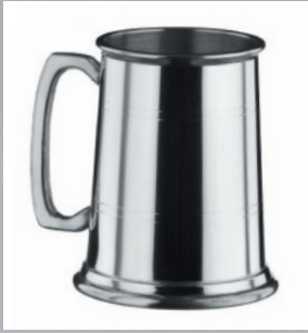
6001 Straight sided 1 pint pewter tankard 12cm h x 10cm base diameter