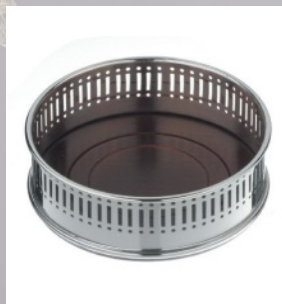
5012 Bottle coaster with a dark wood base and pierced sides 3.5cm h x 11cm diameter