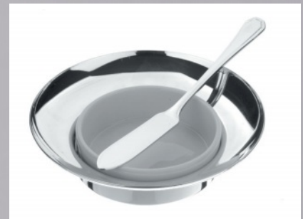
5307 Butter dish with insert and matching butter knife knife 16cm l; dish 14.5cm diameter