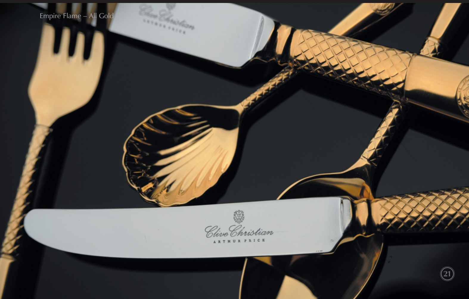
Empire Flame – All Gold