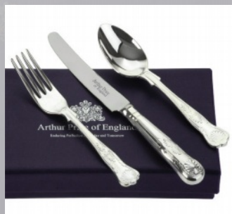
2200 3-piece silver plated child's set Available in most Arthur Price of England cutlery designs