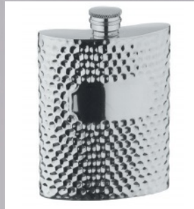
6009 Hammered-style 6oz pewter hip flask 10.5cm h x 9.5cm w