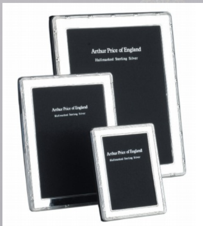
Reed and ribbon hallmarked Sterling Silver frame