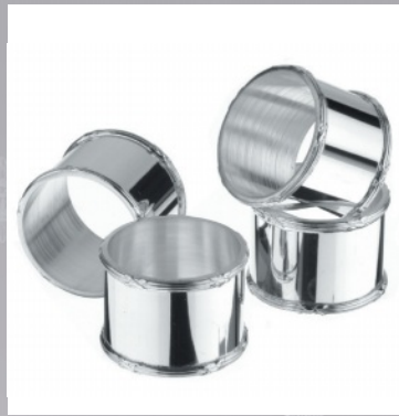
5203 Set of 4 reed and ribbon napkin rings