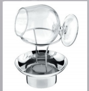
5305 Contemporary brandy warmer and glass 16cm h x 12cm w