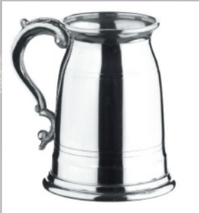
6005 Old London 1 pint pewter tankard 13cm h x 10cm base diameter