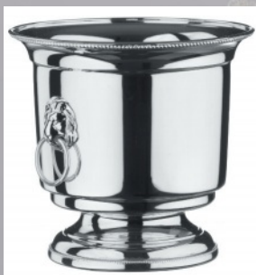
5121 Ice bucket with strainer 15.5cm h x 16cm diameter