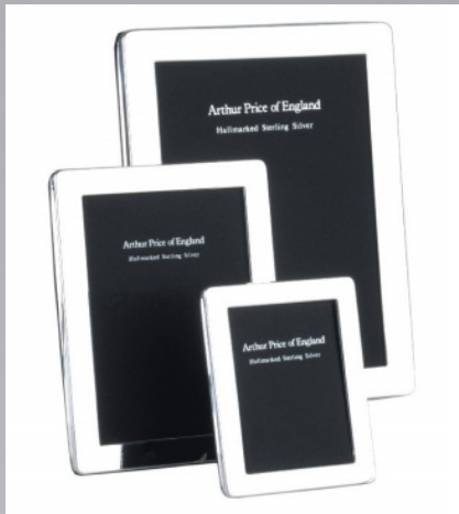
Plain hallmarked Sterling Silver frame