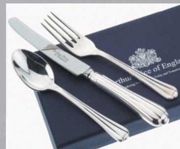
2203 Stainless steel child's cutlery set Available in most Arthur Price of England cutlery designs