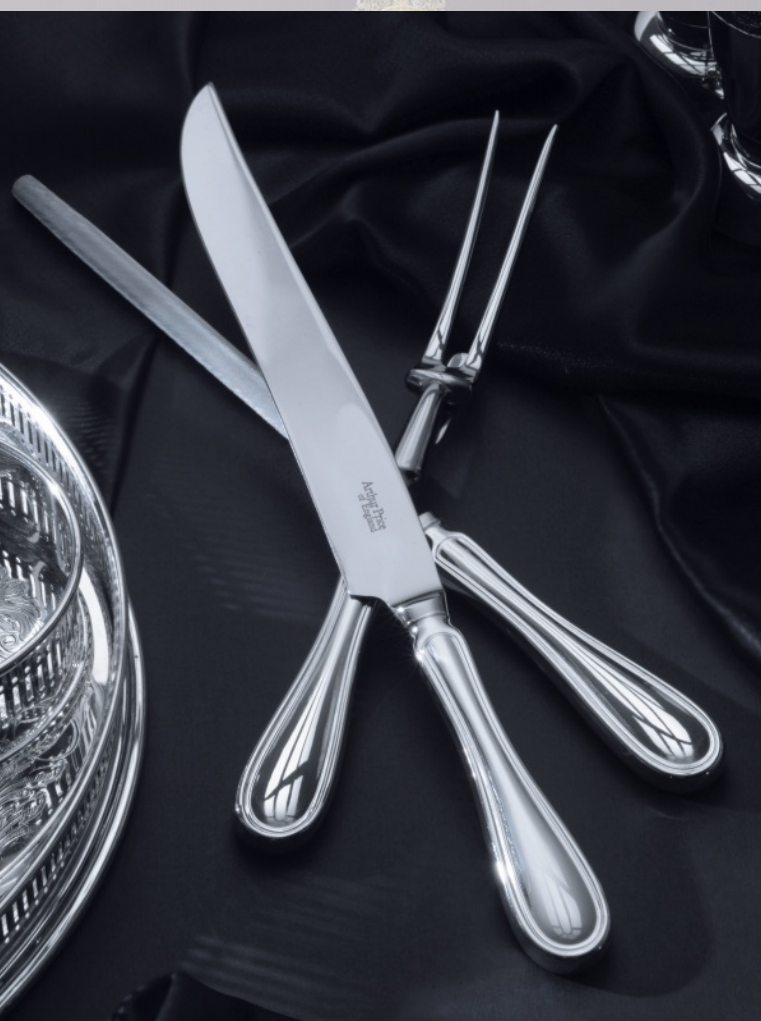
Three Piece Carving Set