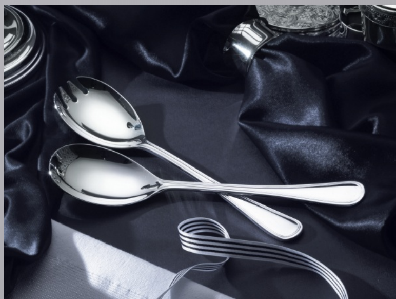
Salad Serving Spoon and Fork