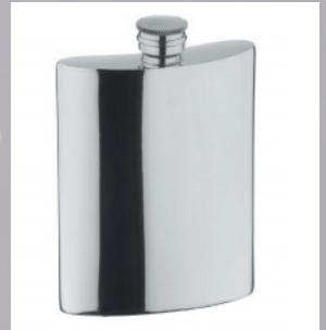
6010 Plain 6oz pewter hip flask 10.5cm h x 9.5cm w