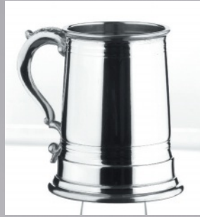
6002 Worcester 1 pint pewter tankard 12.5cm h x 10cm base diameter