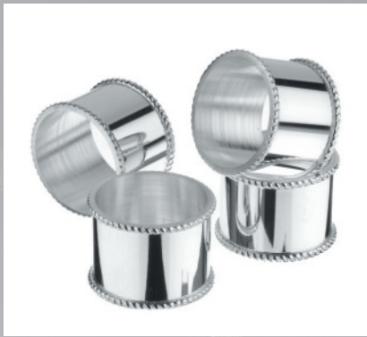
5024 Single mounted napkin ring with a bead border