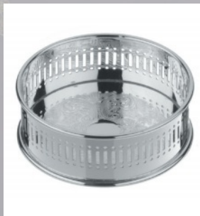
5143 Bottle coaster with a roll chased metal base and pierced sides 4cm h x 11cm diameter