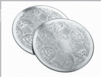
5033 Single 9" table mat