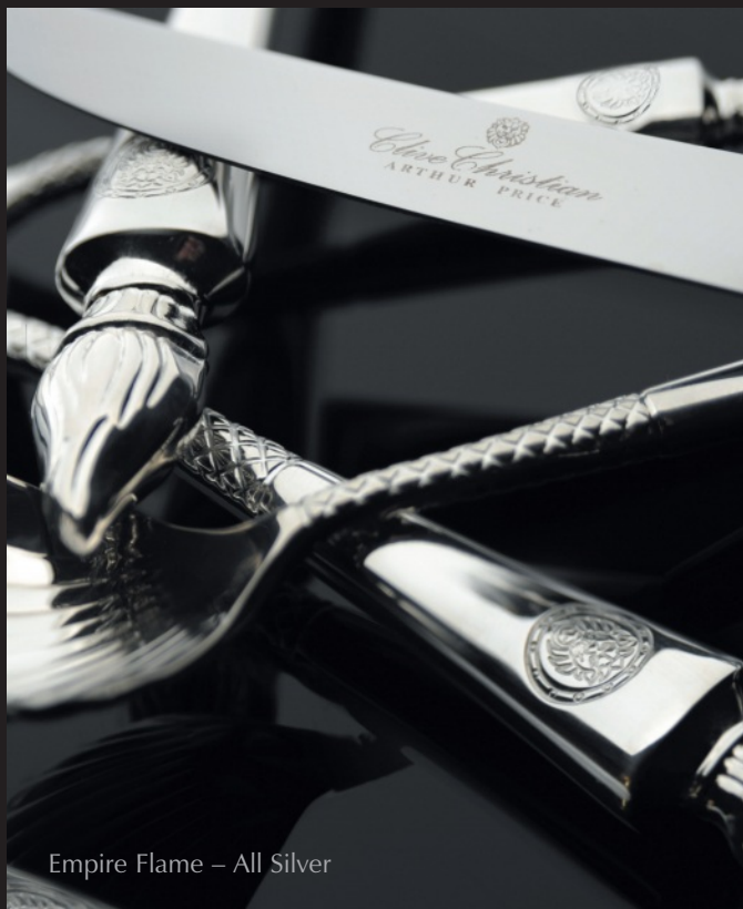
Empire Flame – All Silver