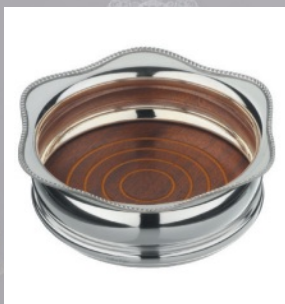
5108 Wavy-edge mounted bottle coaster with a wooden base 5cm h x 15.5cm diameter