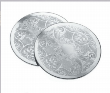
5032 Single 6 1/2" table mat