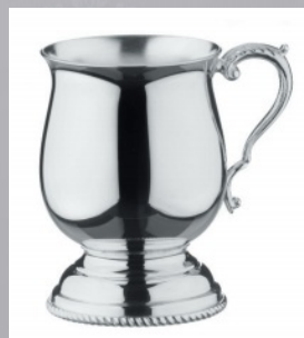
2201 Child's tankard 8cm h x 5.5cm diameter