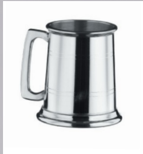
6006 Straight sided 1/2 pint pewter tankard 9.5cm h x 8.5cm base diameter