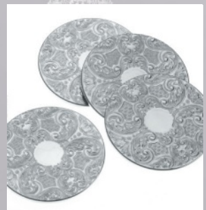
5231 5031 Set of 4 drinks mats Single drink mat 8.5cm diameter