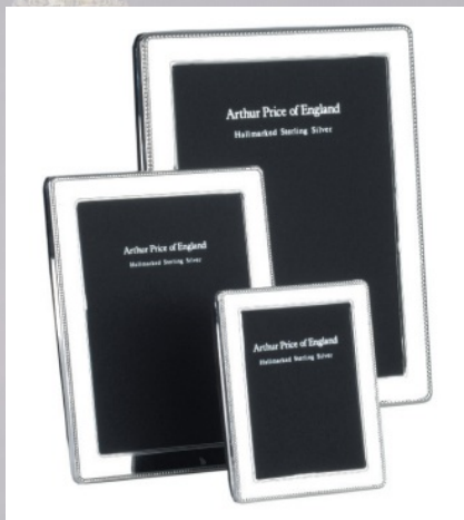
Beaded hallmarked Sterling Silver frame