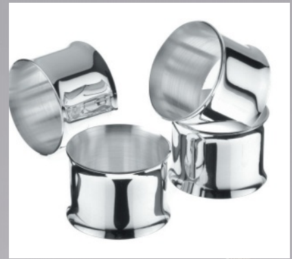
5316 Single napkin ring with curved edges