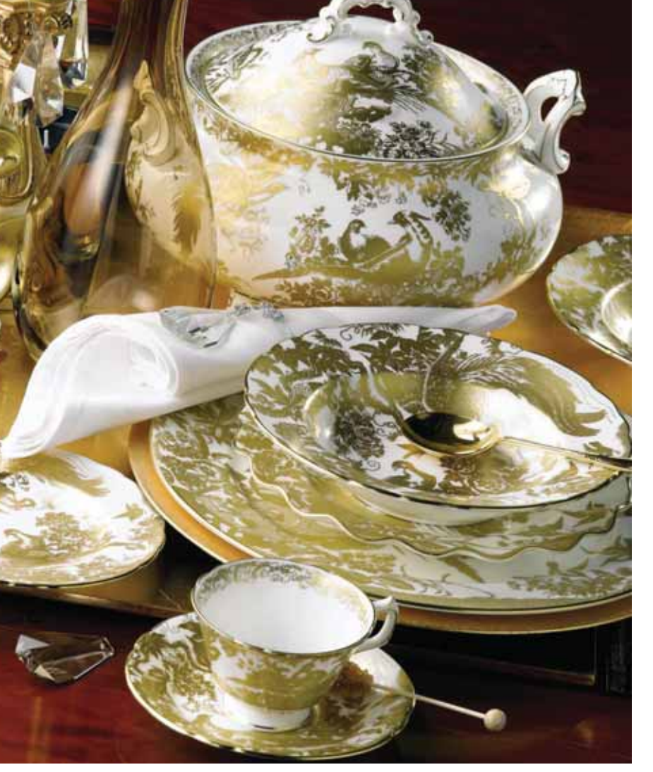
The full range of items available in this shape is shown below. Lead times may vary by item. A further range of serving / gift items are also available.