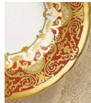
Red & Cream

A wide choice of colour combinations are available subject to the restrictions of the ceramic colour palette. Some examples below.