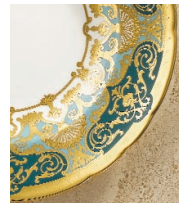
Forest Green & Turquoise